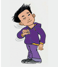
jerks and twitches