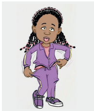
picking or lip smacking